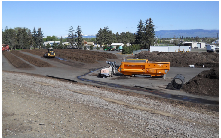
The new facility will include more area for composting, recycling, hazardous waste, and solid waste.