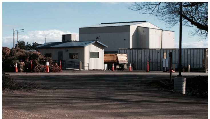
Entering the scalehouse at the current Ellensburg Transfer Station.