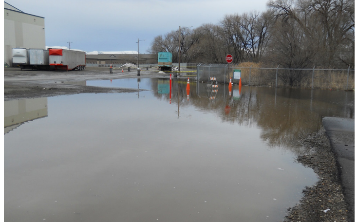
Frequent flooding impacts the current facility.

The new transfer station will be designed to operate in a similar fashion to the existing facility, but will have more capacity and will be located at a more suitable site.